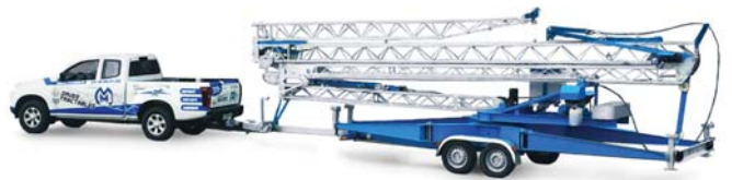
RD-XP: ROAD EXPRESS TRAILER B+E: MNR 3500 Kg

🇪🇸 Mecanismos 🇬🇧 Mechanisms 🇩🇪 Triebwerke 🇵🇱 Mécanismes 🇳🇱 Mechanismen 🇵🇱 Mekanismer 🇵🇱 Mechanizmy